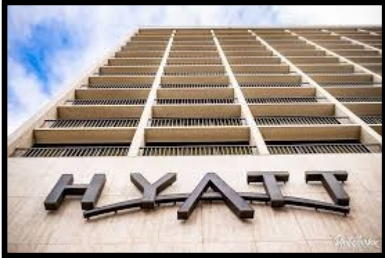
The Hyatt Regency Downtown Tulsa Will host the 2019 Uncorking the Cure for MS